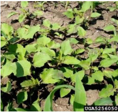
Common cocklebur seedlings