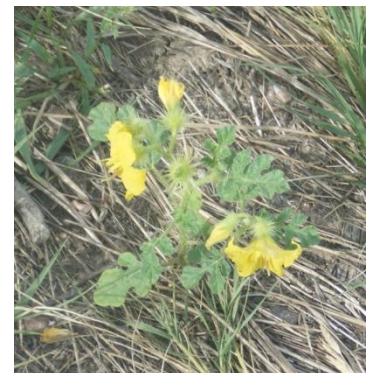
Buffalobur rosettes look like small oak leaves when they first germinate in mid summer