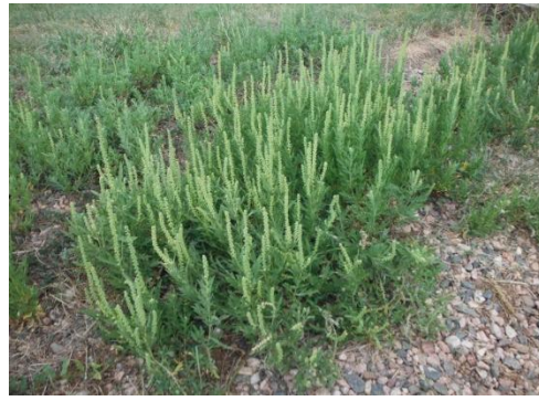
Common ragweed is a native annual plant up to 3' tall and branching frequently.