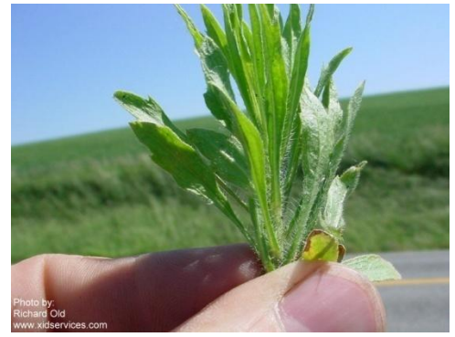
Mareostail/Horseweed: contains tannic acid and gallic acid that may cause skin and mucosal irritation.