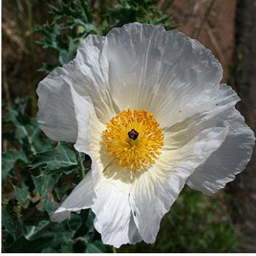
Annual Pricklypoppy have white flowers and yellow sap when broken open.