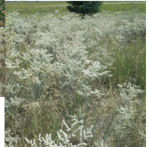
The Umbrella plant has white to bright pink flowers in round heads on leafless stems.