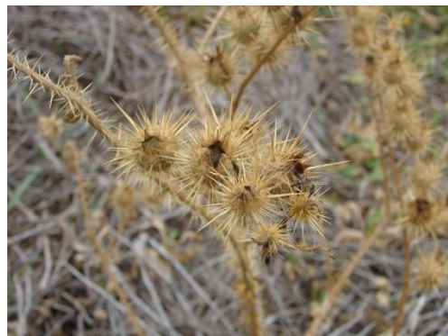
Buffalobur – is very spiny