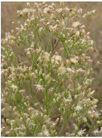
Mareostail/Horseweed: never really flowers anything noticeable.