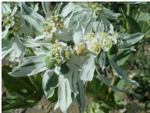
Snow on the Mountain