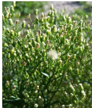
The strong odor of the fetid marigold plant discourages their consumption by livestock.