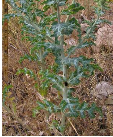
Annual pricklypoppy leaves have spines and blue green color with white veins.