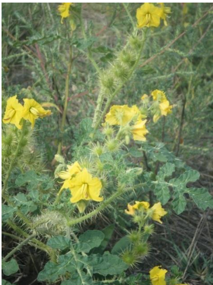
Buffalobur – has yellow flowers