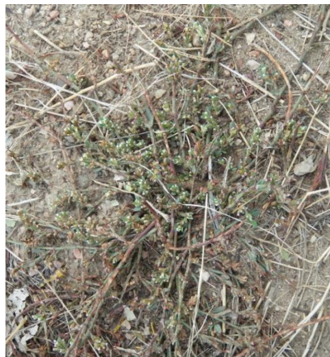
Common Knotweed can have both white and pink colored flowers