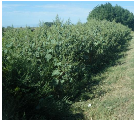
Marsh elder, commonly grows between 3-8 feet high.