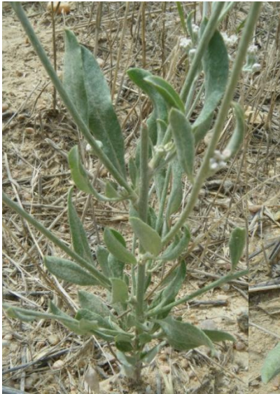
Umbrella Plant Seeds