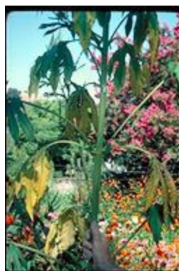
Giant Ragweed is a native annual plant from 3-12' tall