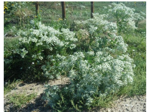
Snow on the mountain infestation.