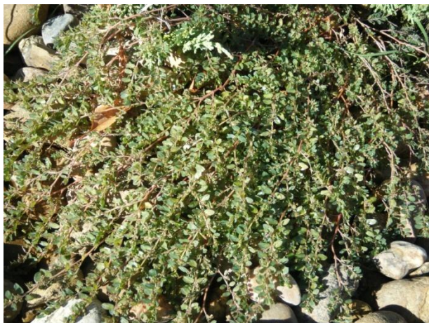
Common Knotweed infestation