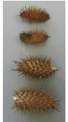
Common cocklebur seeds on the bottom, wild licorice seeds on top