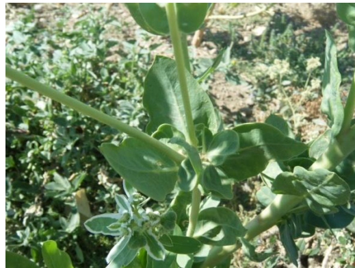
All parts of snow on the mountain are poisonous if ingested. Handling plant may cause skin irritation or allergic reaction.