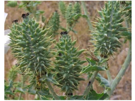
Southwest Colorado Wildflowers, Al Schneider