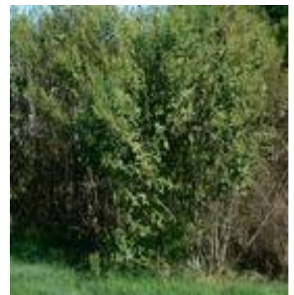
This huge plant is probably an allergy sufferer's worst nightmare.