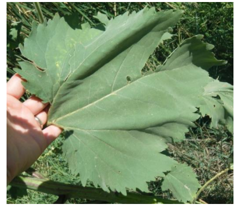
Also called, horseweed, false ragweed, giant marshelder.